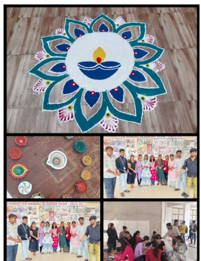
Dil se Diwali