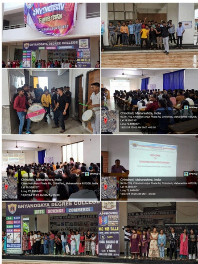
Orientation and flash mob