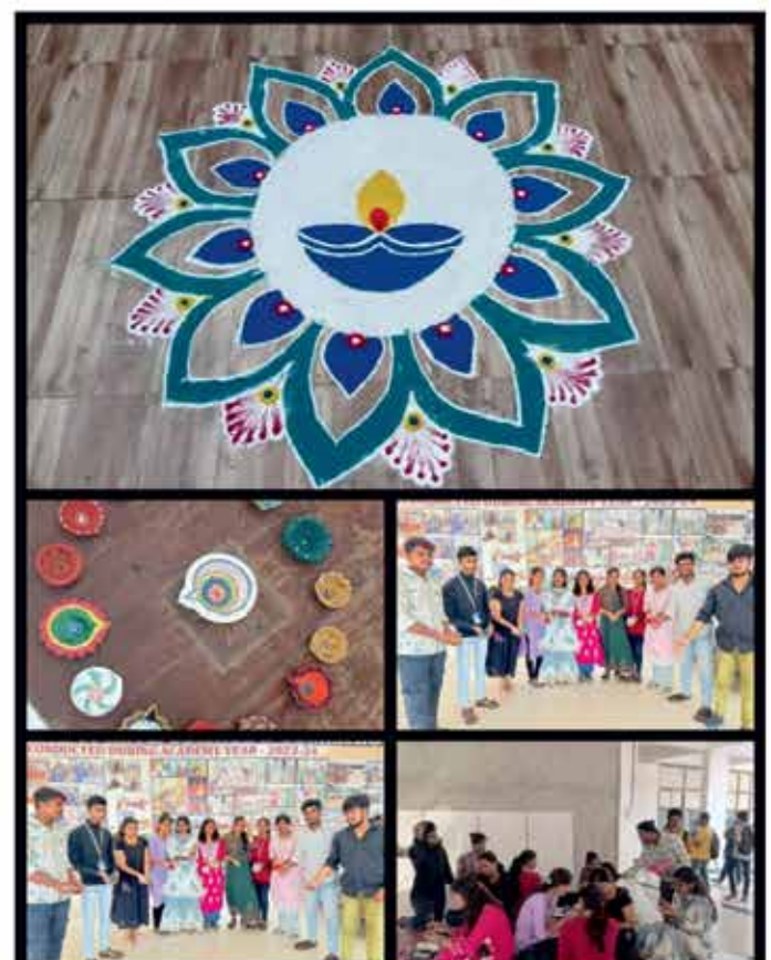
Dil se Diwali