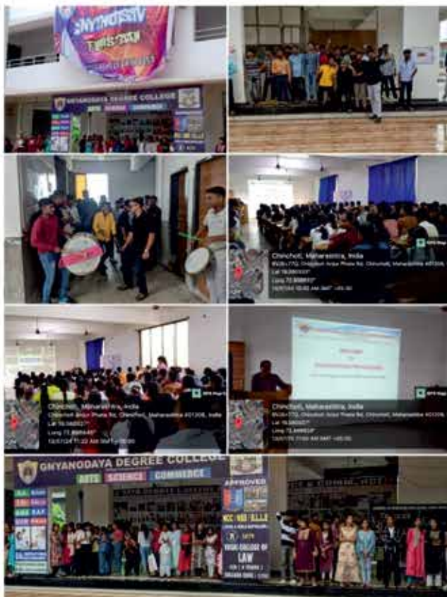
Orientation and flash mob